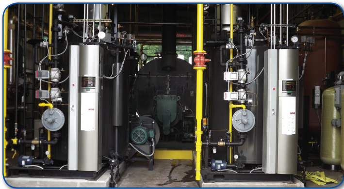
New installation of Miura EX-200 SGO dual-fuel on-demand boilers.

Miura's On-Demand Steam, Fuel Economy, High Performance, and Compact Footprint All Cited as Contributing to Major Efficiency Upgrade